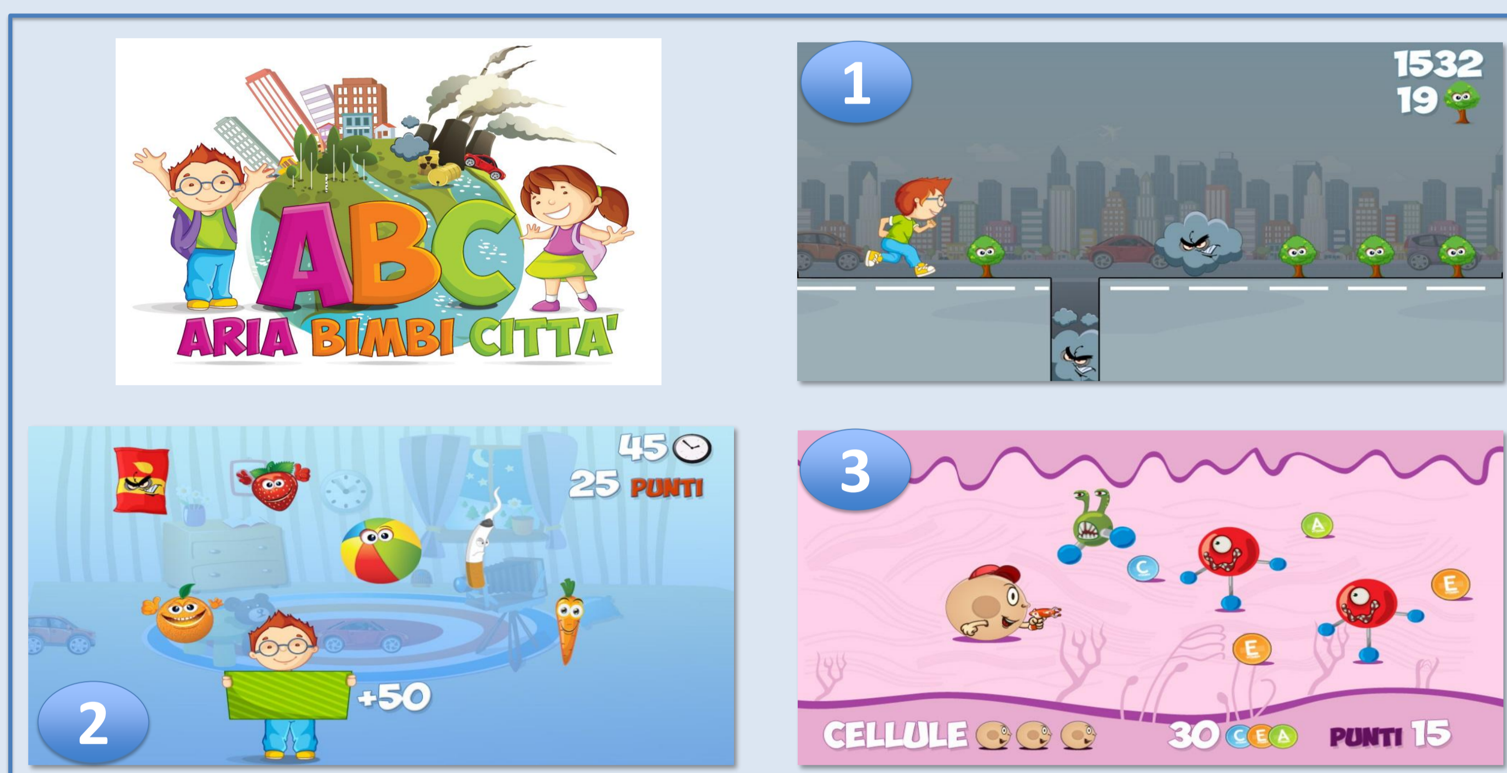
Fig 1. Screenshots of the educational video games realized in the MAPEC_LIFE project.

The type of tool and the topics to insert in the educational package have been discussed in a focus group with primary school teachers and it was decided to use a cartoon and three educational video games, with a more complex explanation for teachers and parents through five dedicated leaflets. They were further tested for efficacy and pleasantness in a pilot test on 266 children attending the second and third grades of seven primary school in four Italian cities (Pisa, Turin, Brescia and Lecce). Finally, a control test on 51 children was carried out to assess the increase of knowledge without the use of video games and educational cartoon.